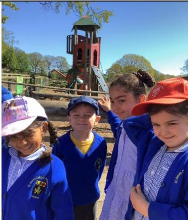
A Fabulous Day at Smithills Farm!