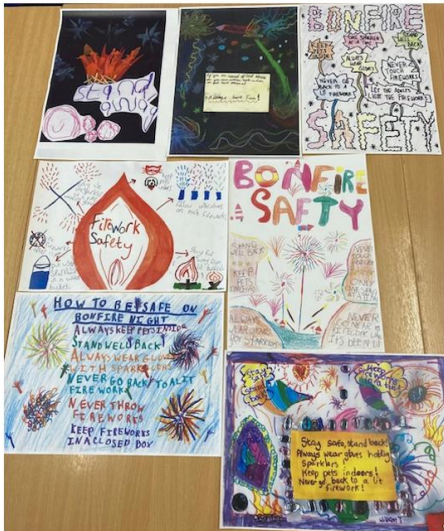
Examples of Previous Winning Posters