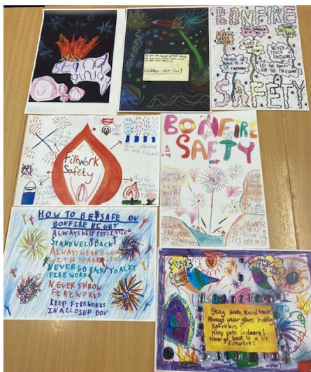
Examples of Previous Winning Posters