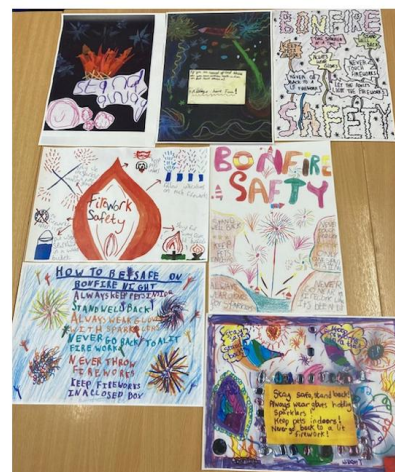
Examples of Previous Winning Posters