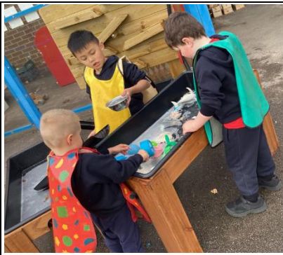
Early Years Fun with their new Water wall !