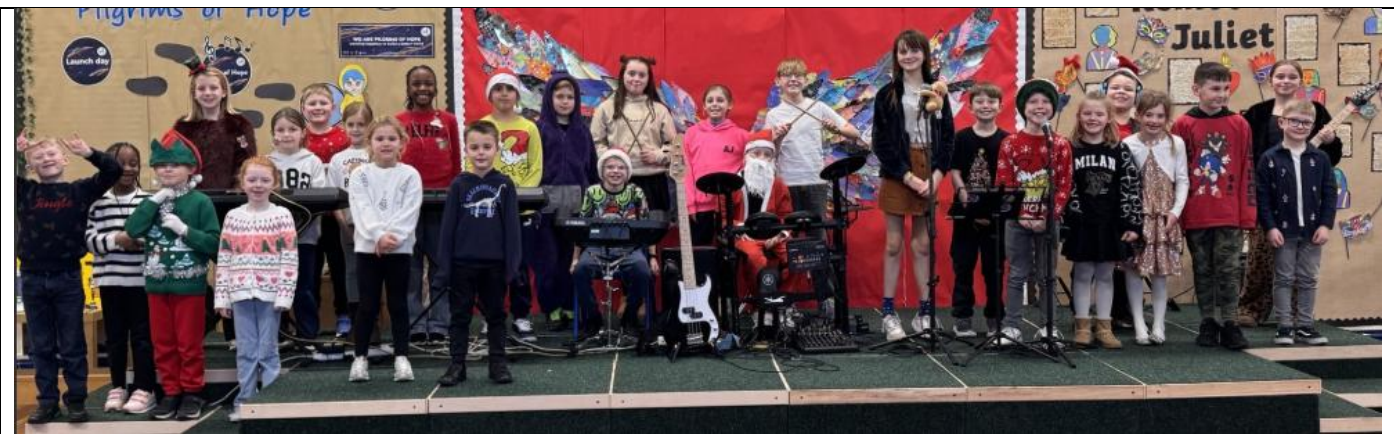
We ended the term with a fantastic Rock Steady performance from our four school bands! Well done everyone!